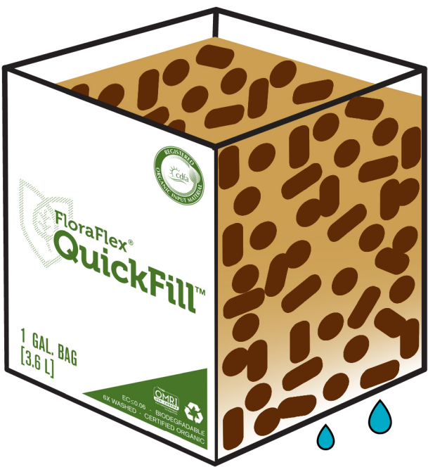
EXAMPLE 30% DRYBACK AND 5% IRRIGATION CYCLES