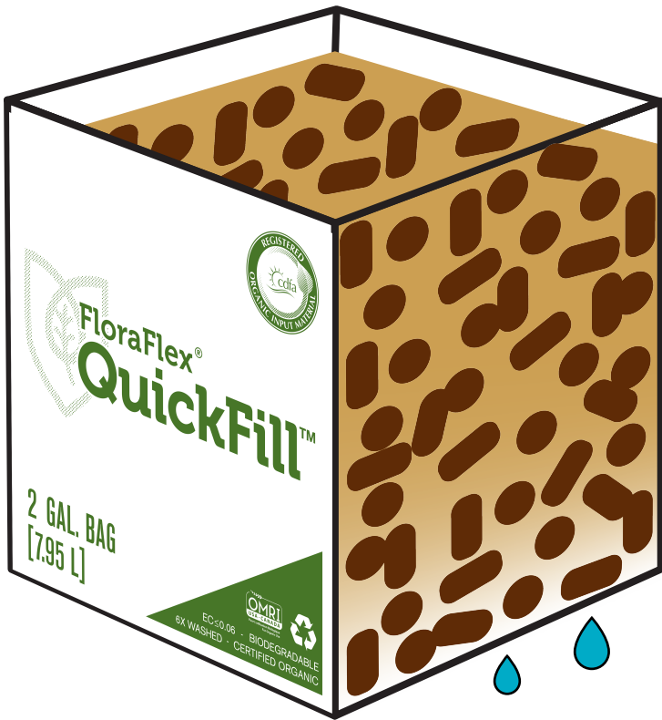
EXAMPLE 30% DRYBACK AND 5% IRRIGATION CYCLES